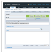
Custom field in publish form