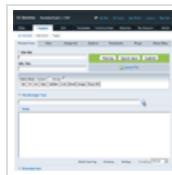
Custom field in publish form